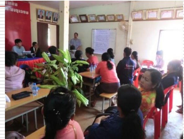
Kickoff meeting with village residents