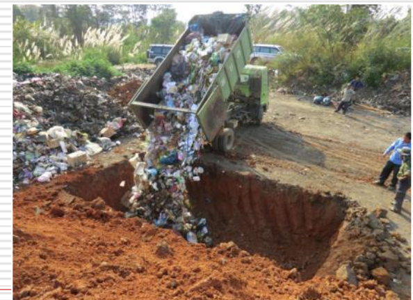
Training of landfill operation