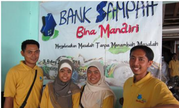
Staff at a Surabaya waste bank