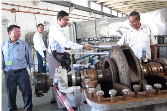
Myanmar officials receive practical training on water and sanitation management