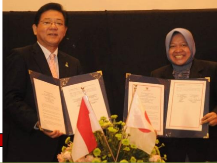
Green Sister City (Nov. 2012)

Kitakyushu Asian Center for Low Carbon Society