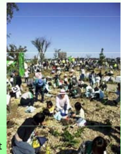
■ Project to create Nagoya West Forest