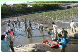
■ Research on creatures in reservoirs