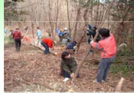
■ Project to expand Nagoya Higashiyama Forest